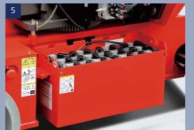
5 Standard tracking battery: Reduce 40% of the charge time, raise 50% of the life time