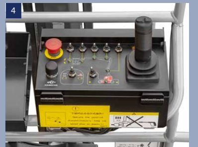
4 Basket control box: each action of the device can be controlled through the control box to quickly reach the working area, and the control is simple and easy to understand