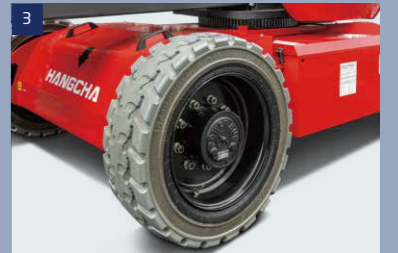
3 Tires: foam-filled tires with good off-road performance