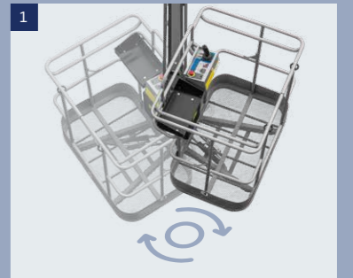
1 Basket: can be rotated left and right at an Angle of 140°