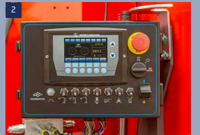
2 Base control box: the control box can be used to control each action of the device, easy to understand